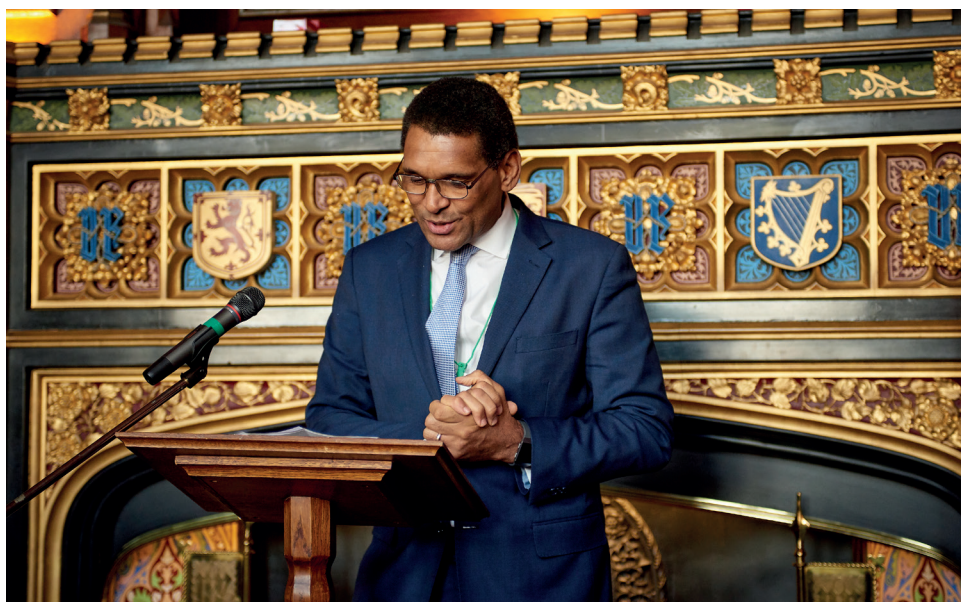
APM president David Waboso launched the new standard at the celebration of the Royal Charter for APM, at Speakers House in the Palace of Westminster on 30 November 2017

“ChPP recognises the diverse paths individuals may take to achieving the standard”